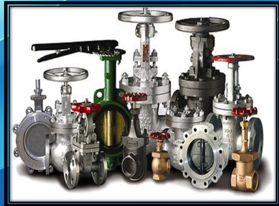
PIPELINE AND VALVES