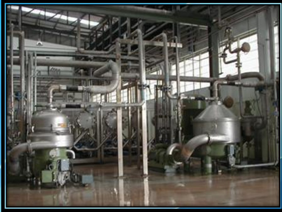
COOLING TOWER (WITH PUMP & PIPING)